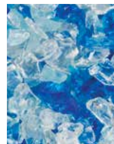
Sapphire Blue Media