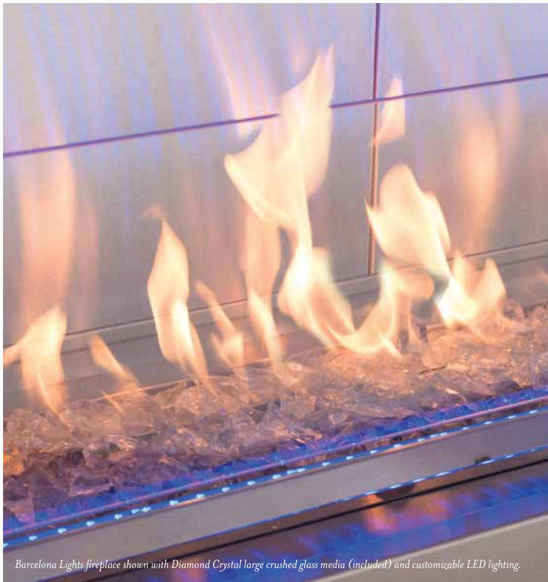
Barcelona Lights fireplace shown with Diamond Crystal large crushed glass media (included) and customizable LED lighting.