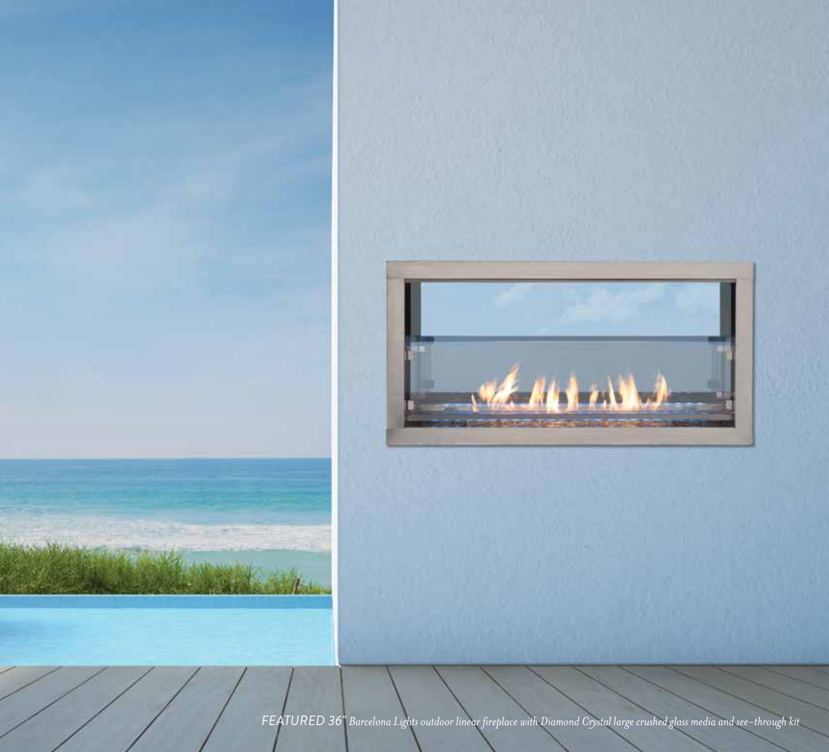
FEATURED 36" Barcelona Lights outdoor linear fireplace with Diamond Crystal large crushed glass media and see-through kit

The Barcelona Lights linear fireplace offers a customizable look for any outdoor living space. Set the mood or match the season with interior LED lights and flames dancing on a bed of large crushed glass. Weather-resistant stainless steel construction offers both durability and eye-catching appeal to outdoor spaces. Each Barcelona Lights fireplace allows single-sided or optional see-through installation.